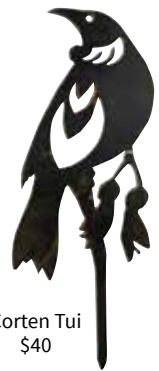
Corten Tui $40