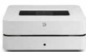
Bluesound Vault 2i storage device. Store your CD collection on your own high quality audio server. All file formats available. Come in store for a demo $2699

Klipsch McLaren tribute powered speakers "The Fives" - Black with McLaren F1 trim colour $2999 - non McLaren model also available $1799