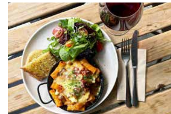
Shop • Eat • Enjoy on your travels | page 16