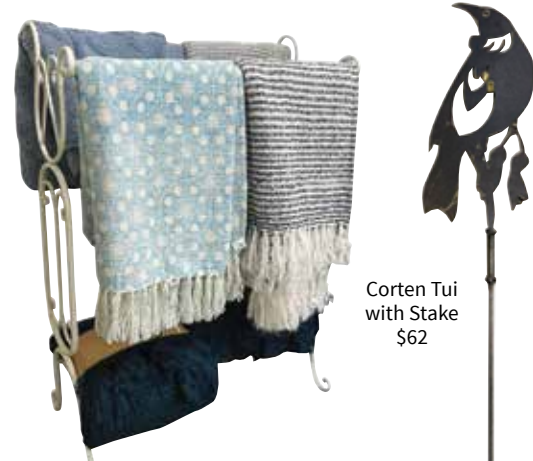
Corten Tui with Stake $62