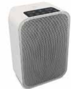
Sangean Euphonic Portable FM Radio with Bluetooth $299