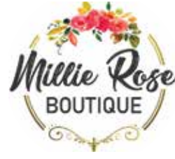
Ivy + Jack Billie floral $159.90