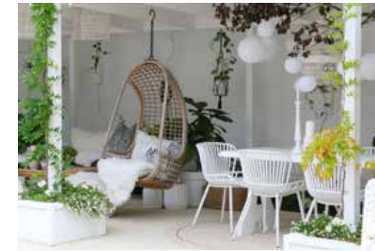
essential home | page 6