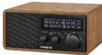
Sangean WR11 mantle Am/ FM Radio with Bluetooth. Wooden case for great sound quality. $499