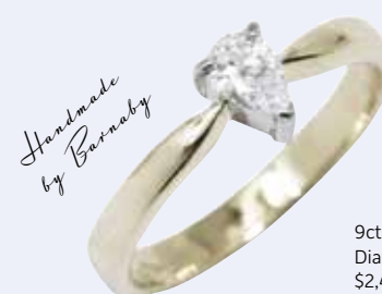
9ct Gold & Diamond Ring, $2,490