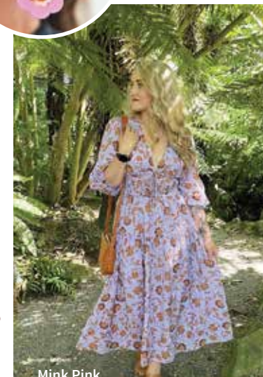
Mink Pink Luna Midi Dress $160

Millie Rose Boutique 281 Stafford Street, Timaru www.millierose.co.nz