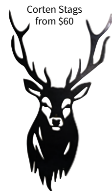
Corten Stags from $60