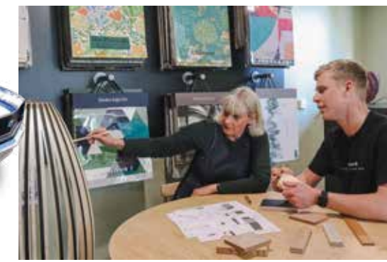
essential profile | page 5