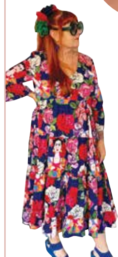
Magic Frida Dress $199