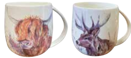
Bone China Mugs $29.90

Homewares, Garden Art & Lifestyle Store featuring unique Furniture by Evoli.