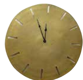
Brass Clock $399.50