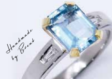
9ct White Gold Aquamarine & Diamond Ring, $3,675