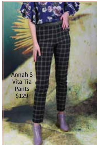
Annah S Vita Tia Pants $129

72 - 76 Talbot Street, Geraldine (old Barker's Shop) Phone 0274 313 362 or visit us on FaceBook