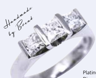
Platinum & Diamond Ring, $11,990

The Ringmakers Manufacturers of Fine Jewellery