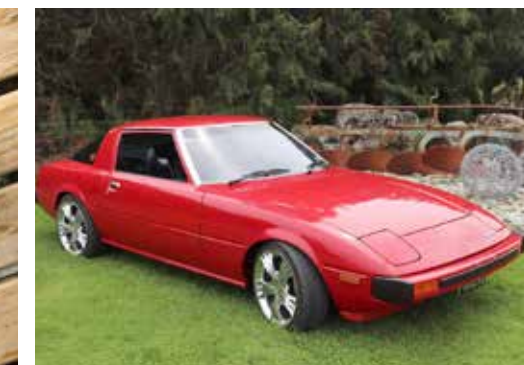
Classic car enthusiast | page 15

Front Cover: The annual Caroline Bay Rock and Hop is on March 16 - 19 with an amazing array of classic cars, bikes and caravans from across New Zealand congregating in Timaru. All funds raised from the event will go to Hospice South Canterbury. See feature from page 8.