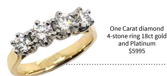
One Carat diamond 4-stone ring 18ct gold and Platinum $5995