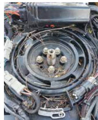
'BIRDS NEST' Don't let this happen to your boat make sure to service it before taking it on the water.

5. HAVE A BACKUP SKIPPER You should have someone who is familiar with safety procedures, boat handling, and operations as a backup driver if an emergency arises or even if the main skipper simply becomes too tired to drive the boat.