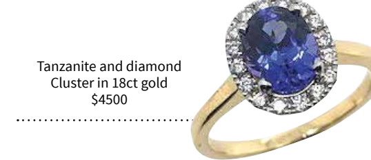
Tanzanite and diamond Cluster in 18ct gold $4500