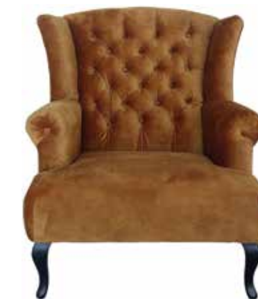
Mustard Velvet Winged armchair $1499