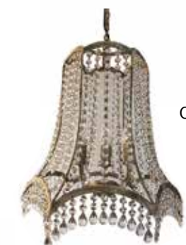
Crystal Chandelier $1299