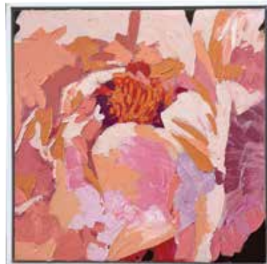
Bloom Framed Canvas $499