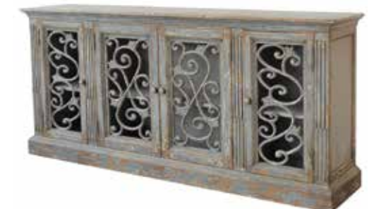
Distressed blue Sideboard $3999