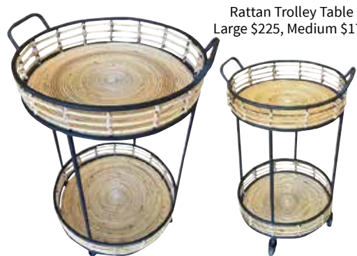
Rattan Trolley Table Large $225, Medium $175