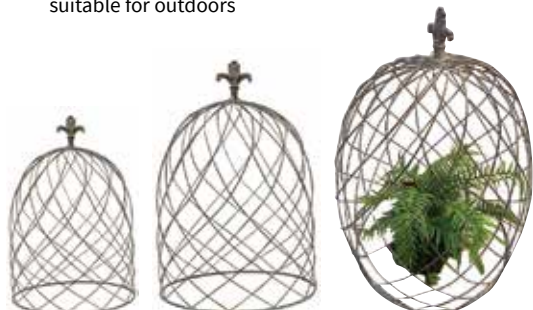
Cloche Domes S $39.90, M $49.90, L $59.90

Open 7 Days Cnr Seadown Road & Hilton Highway, Washdyke Ph (03) 688 7662 www.hopkinsons.co.nz