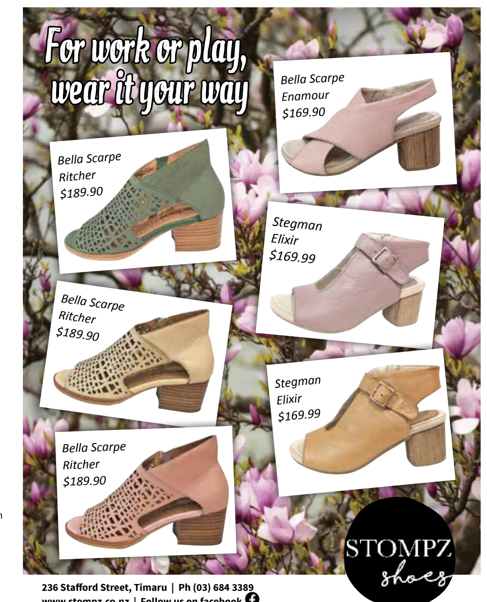
STOMPZ shoes 236 Stafford Street, Timaru | Ph (03) 684 3389 www.stompz.co.nz | Follow us on facebook