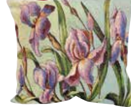
Floral Cushion $25