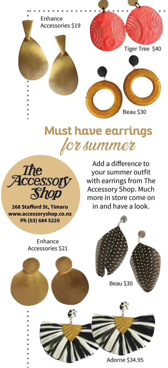
The Accessory Shop 268 Stafford St, Timaru www.accessoryshop.co.nz Ph (03) 684 5220