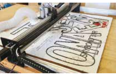
A sneak peek behind the scenes at Branded Kiwi