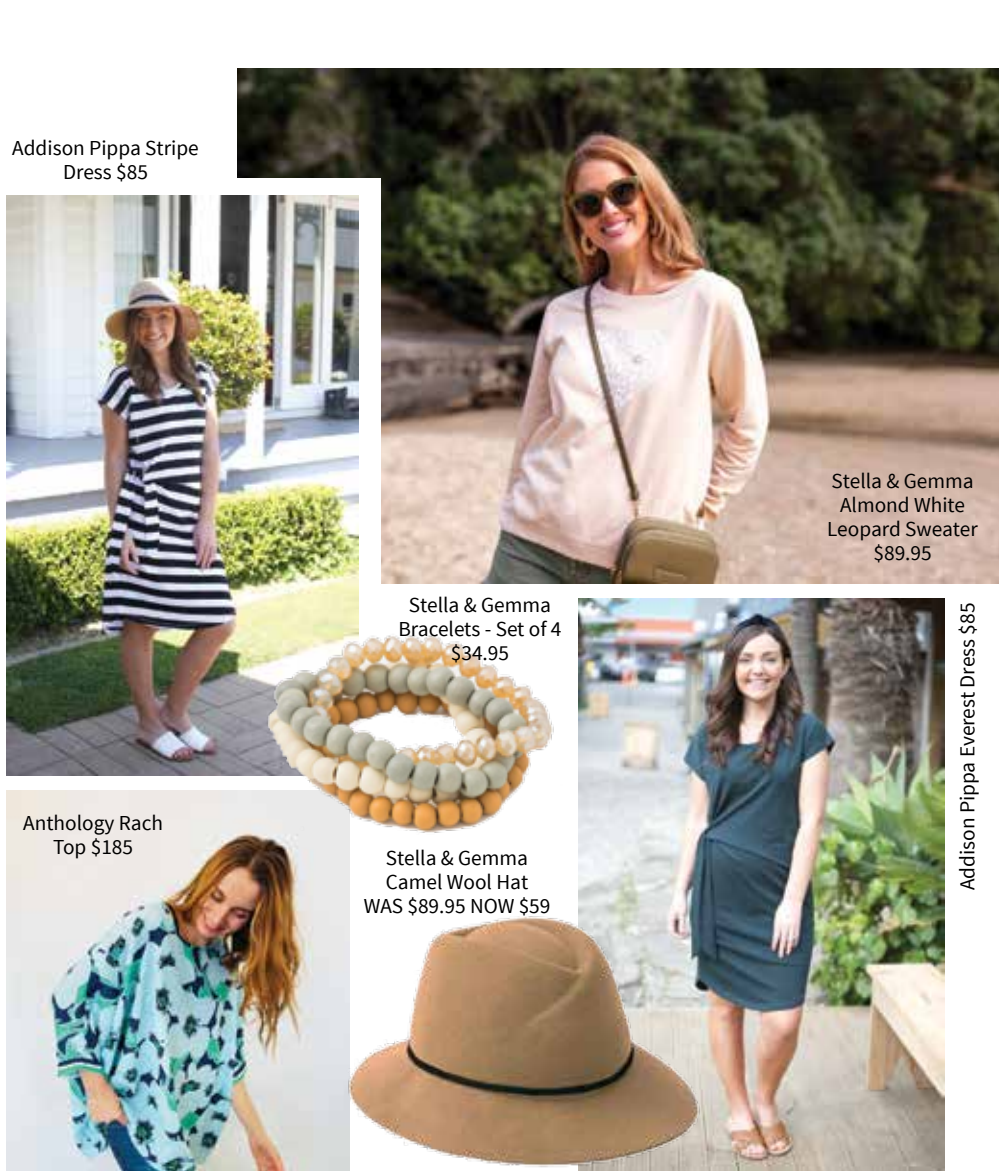
MINT BOUTIQUE 72 Main Street, Fairlie. Ph (03) 685 8084 www.mintboutique.co.nz