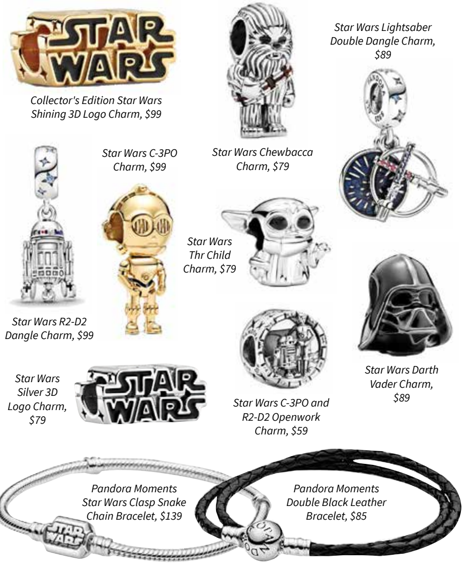
Star Wars Lightsaber Double Dangle Charm, $89 Collector's Edition Star Wars Shining 3D Logo Charm, $99 Star Wars C-3PO Charm, $99 Star Wars Chewbacca Charm, $79 Star Wars Thr Child Charm, $79 Star Wars R2-D2 Dangle Charm, $99 Star Wars Silver 3D Logo Charm, $79 Star Wars C-3PO and R2-D2 Openwork Charm, $59 Star Wars Darth Vader Charm, $89 Pandora Moments Star Wars Clasp Snake Chain Bracelet, $139 Pandora Moments Double Black Leather Bracelet, $85

For all true Star Wars™ devotees: the Limited Edition Collector's charm, handfinished in Pandora Shine with contrasting shiny black enamel.