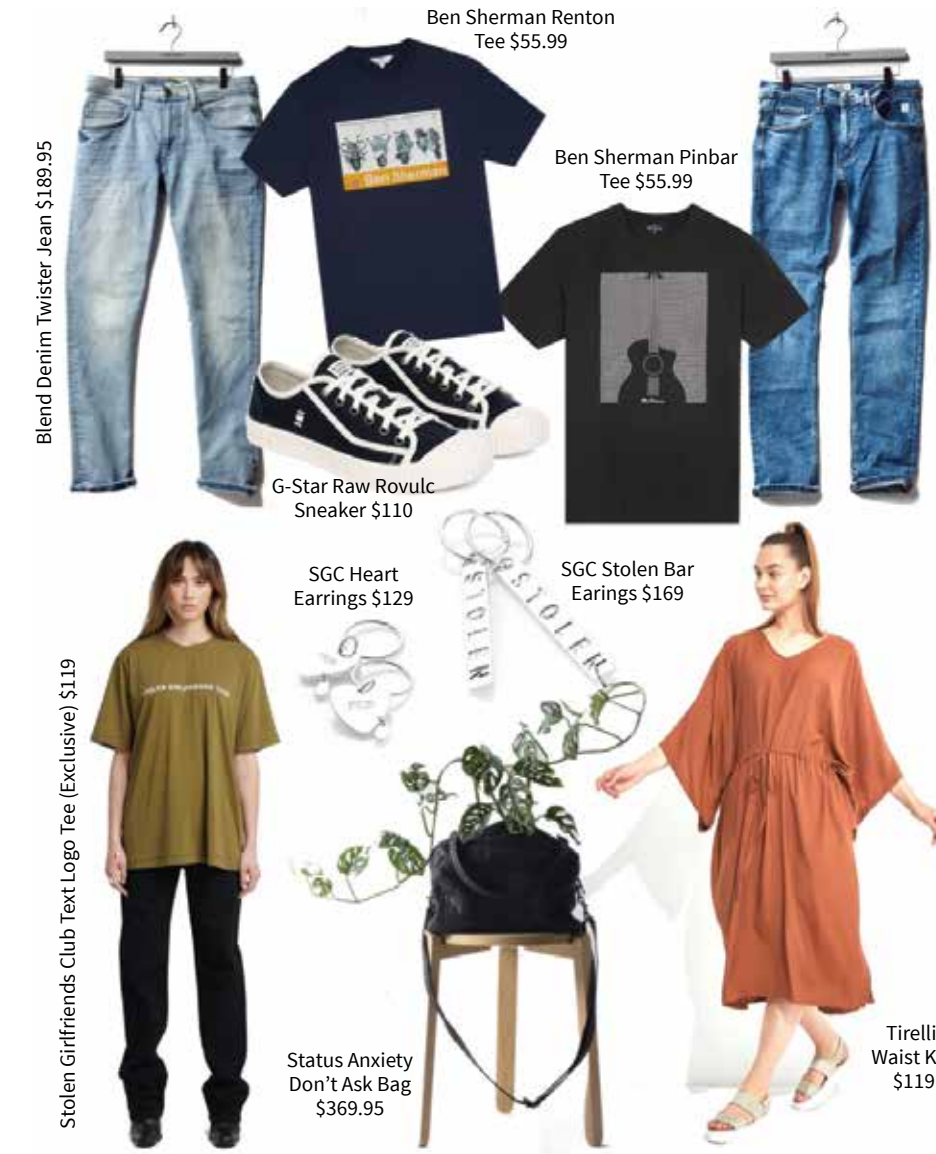
BLANK SPACE. 79 Main St, Fairlie | Ph (03) 685 6112 www.blankspacethestore.com