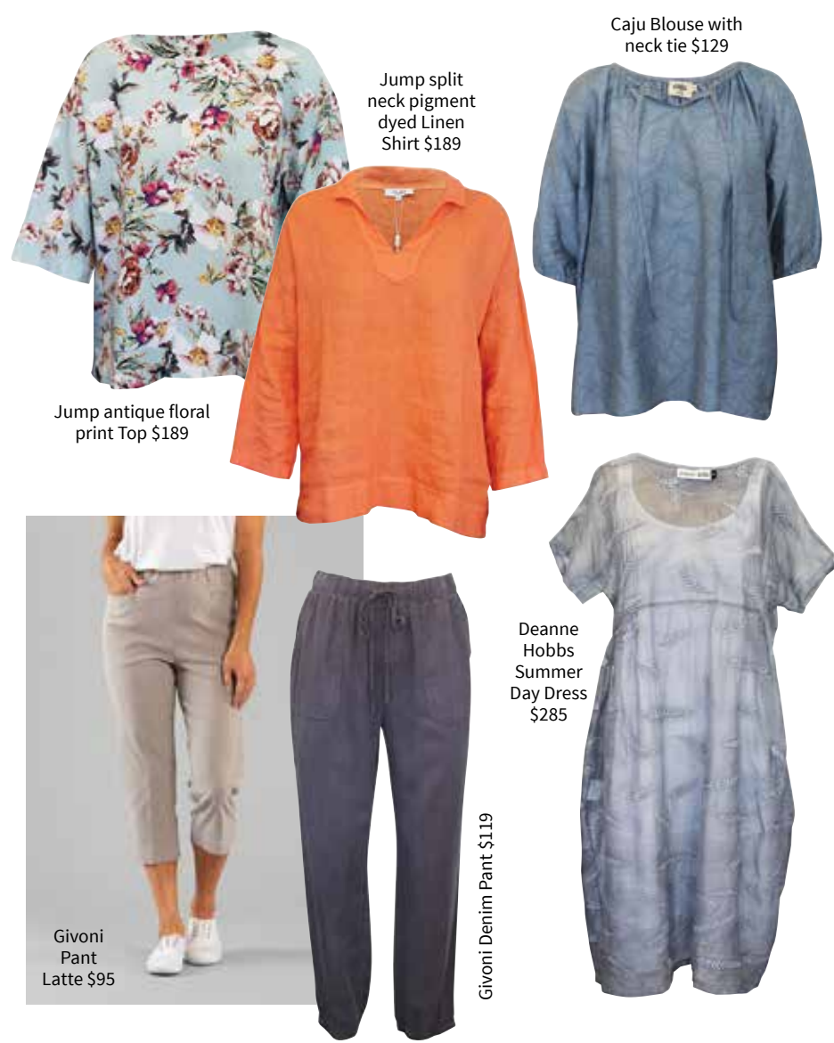
FASHION FOCUS Highfield Mall, Wai-iti Road, Timaru Ph (03) 688 8711 www.fashionfocus.co.nz