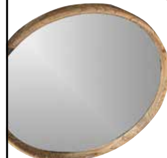
Round Wooden frame Mirror $216