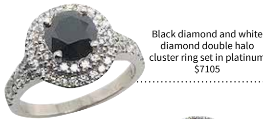
Black diamond and white diamond double halo cluster ring set in platinum $7105