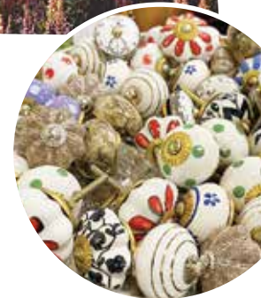
Beautiful Ceramic Knobs $9 each