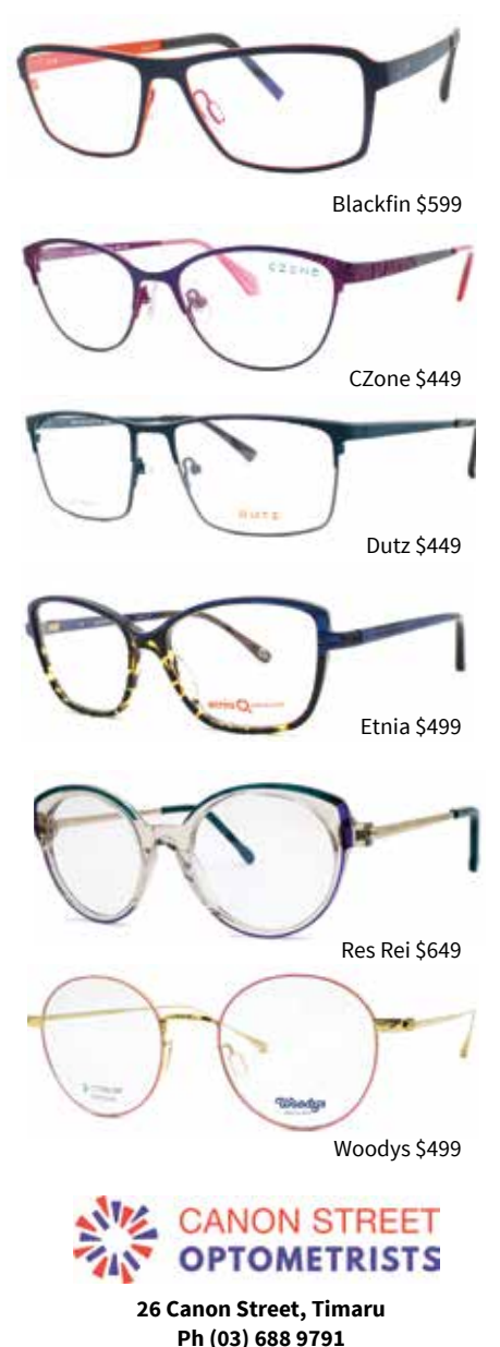
CANON STREET OPTOMETRISTS 26 Canon Street, Timaru Ph (03) 688 9791