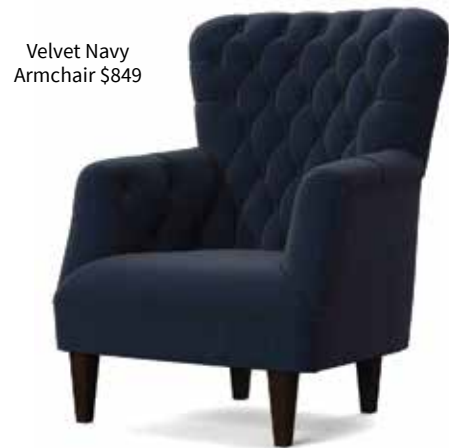
Velvet Navy Armchair $849

The friendly team at Hopkinsons welcome you to visit their store full of beautiful furniture and homewares. While you are there take the time to enjoy a coffee and something to eat from Cafe Pharlap. NZTA & NZ Post Agency.