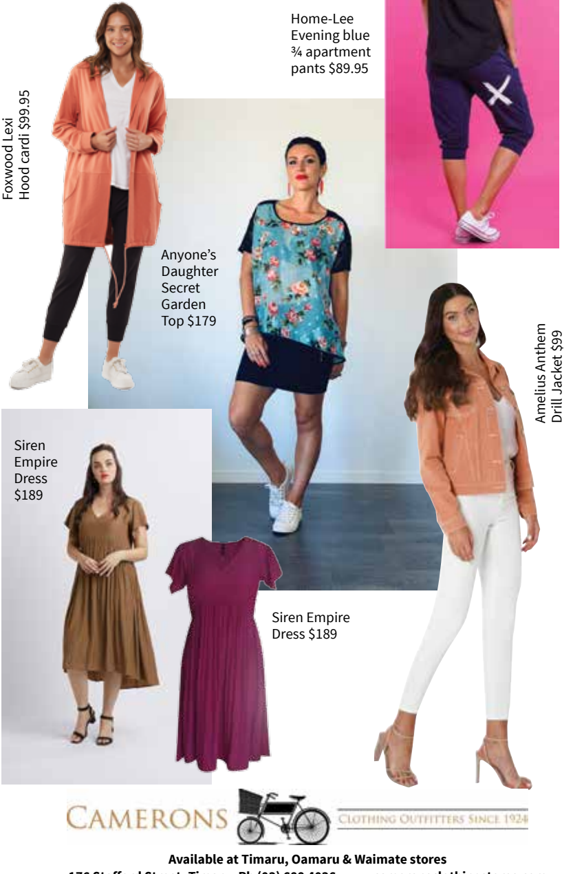
CAMERONS Available at Timaru, Oamaru & Waimate stores 176 Stafford Street, Timaru. Ph (03) 688 4036 www.cameronsclothingstores.com