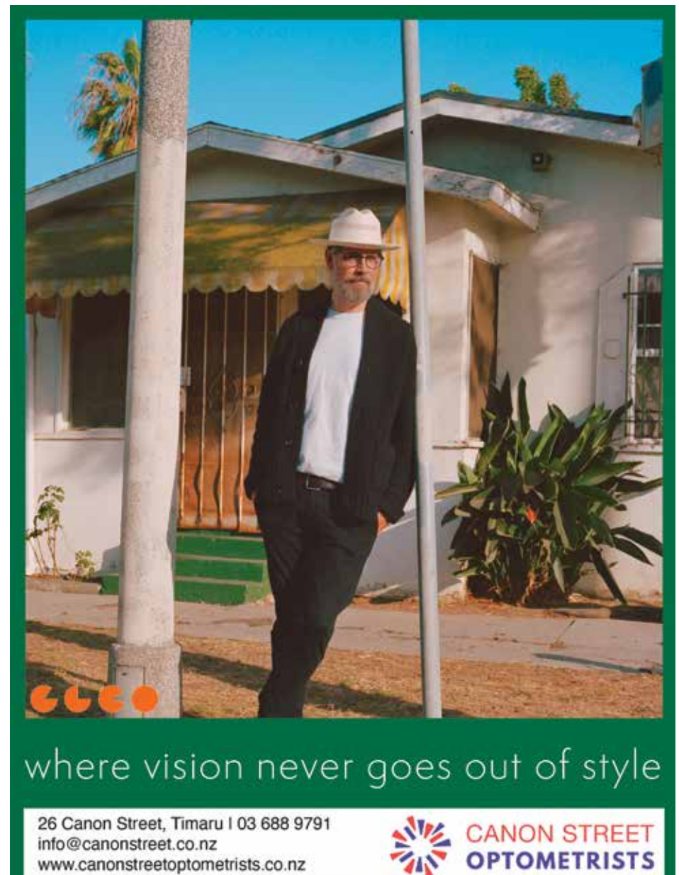
CANON STREET OPTOMETRISTS 26 Canon Street, Timaru | 03 688 9791 info@canonstreet.co.nz www.canonstreetoptometrists.co.nz