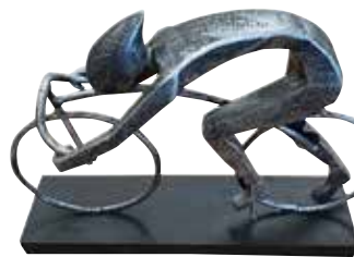
Metal Cyclist $75