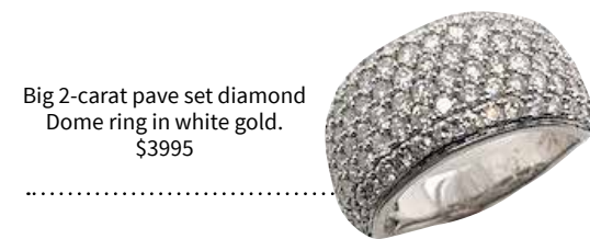
Big 2-carat pave set diamond Dome ring in white gold. $3995

304 Stafford Street, Timaru. Ph (03) 688 9835 www.ronbrownjewellers.co.nz