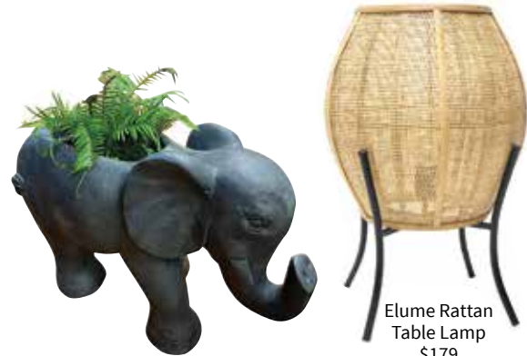
Elephant Planter $349 suitable for outdoors