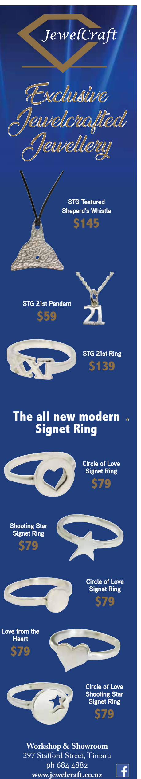
JewelCraft Exclusive Jewelformed Jewellery Workshop & Showroom 297 Stafford Street, Timaru ph 684 4882 www.jewelcraft.co.nz