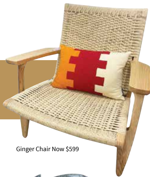
Ginger Chair Now $599