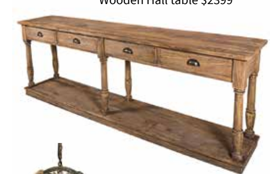
Wooden Hall table $2399