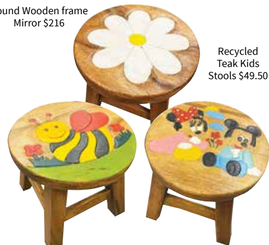
Recycled Teak Kids Stools $49.50

Tievoli Trading 72 - 76 Talbot Street, Geraldine (old Barker's Shop) Phone 0274 313 362 or visit us on Facebook