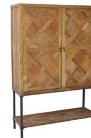
Wooden Cabinet $2149