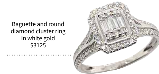
Baguette and round diamond cluster ring in white gold $3125