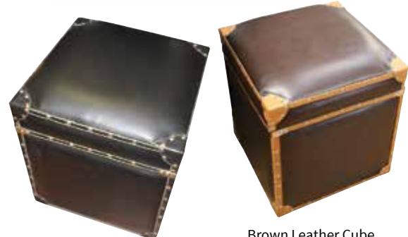
Black Leather Cube Ottoman $159