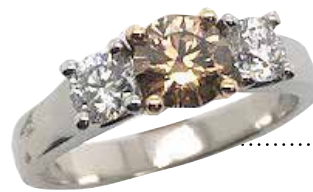
Cognac and white diamond ring set in 18ct white gold $7995

New to our wonderful selection of Engagement rings and Dress rings.