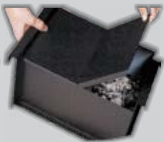
Ash pan for easy and clean disposal.