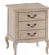
White Washed Weathered Oak 3 drawer bedside $335