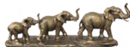
Bronzed Elephant Family $109.50

We believe that beautiful homewares don't have to cost a fortune.