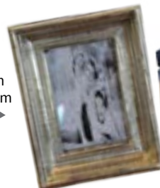
Aluminium frames - from $28.50