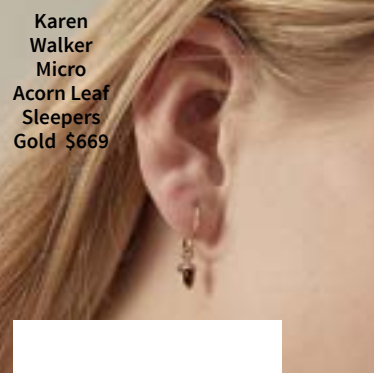
Karen Walker Micro Acorn Leaf Sleepers Gold $669