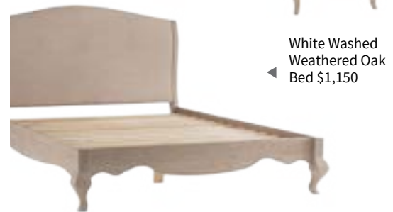
White Washed Weathered Oak Bed $1,150