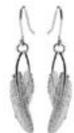
Boh Runga Feather Earrings $269