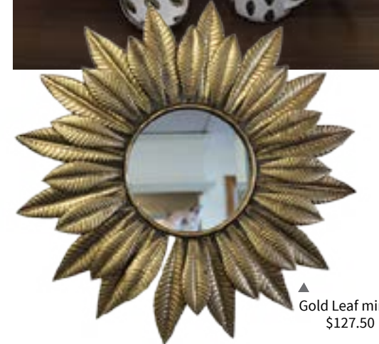
Gold Leaf mirror $127.50