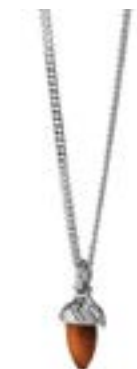
Micro Acorn and Leaf Necklace Silver $279

304 Stafford Street, Timaru. Ph (03) 688 9835 www.ronbrownjewellers.co.nz