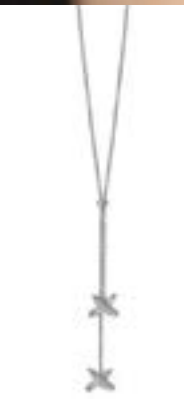
Boh Runga Double Kisses Pendant $209