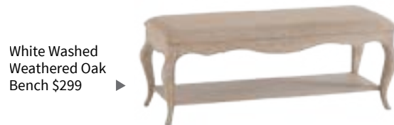
White Washed Weathered Oak Bench $299