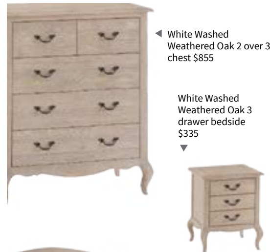
White Washed Weathered Oak 2 over 3 chest $855

The friendly team at Hopkinsons welcome you to visit their store full of beautiful furniture and homewares. While you are there take the time to enjoy a coffee and something to eat from Cafe Pharlap. NZTA & NZ Post Agency.