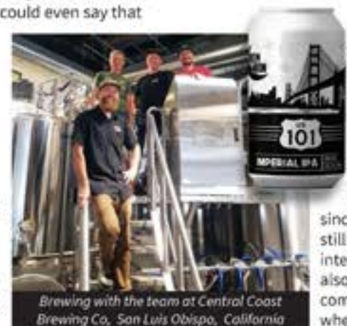
Brewing with the team at Central Coast Brewing Co, San Luis Obispo, California

brews that are lower in alcohol, juicy tasting and very often as cloudy as orange juice too. Hazy IPAs are the new trend and I especially like the term they use when they're canned - 'juicy tubes'. Kinda says it all really. It's a beer style we've been playing around with a lot back at the Brew Moon lately, so swing by our taproom for a taste of the latest batch.