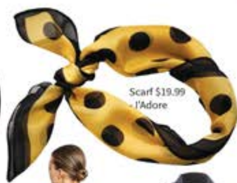
Scarf $19.99 - l'Adore

Accessories: These may often be small but they play a big role in styling. Try layered necklaces, big, heavy scarves and belted jackets.