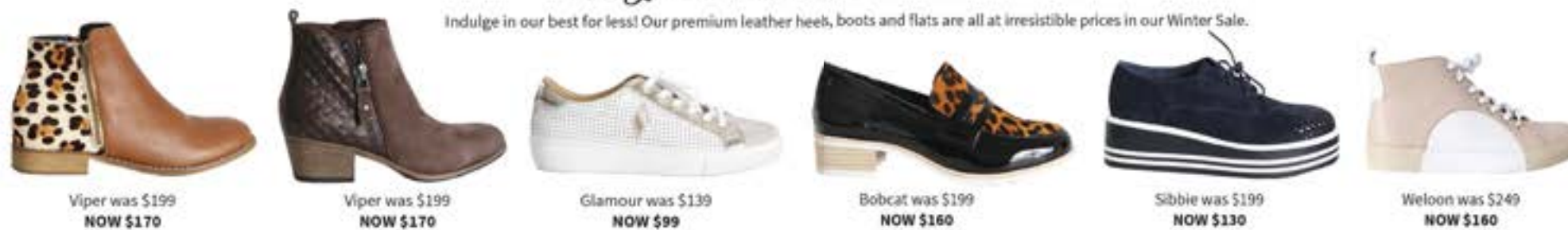
Viper was $199 NOW $170

Indulge in our best for less! Our premium leather heels, boots and flats are all at irresistible prices in our Winter Sale.