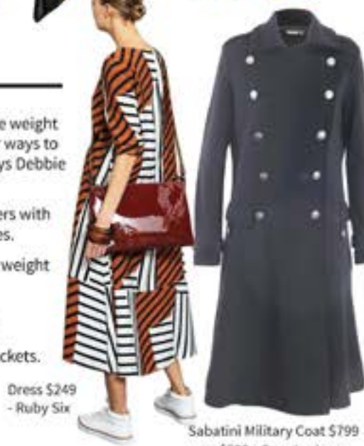
Dress $249 - Ruby Six