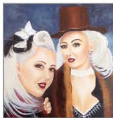
11 Kaiapoi Art Expo