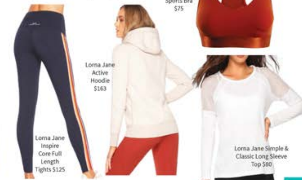
Lorna Jane Inspire Core Full Length Tights $125

Iconic Australian brand Lorna Jane offers the ultimate in active wear with quality fabrics and beautifully designed pieces that you'll want to wear far beyond the gym. From classics like the Active Hoodie engineered to keep the cold out and the warmth in, to the fun and funky Nothing 2 C Here paisley tights - Lorna Jane pieces manage to combine hi-performance features such as moisture wicking and breathability with a stylish flair that will take you from spin class to brunch without missing a beat. Check out the Lorna Jane range at the Sport Shop.