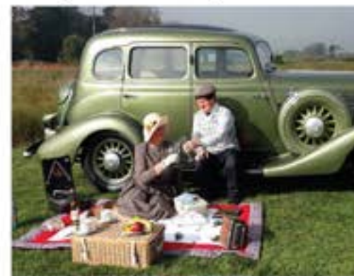
19 Essential Motoring