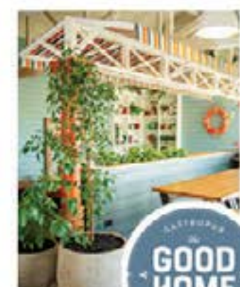
Front cover image supplied by The Good Home

Summer is a great time - let's make the most of it! - Dorothy