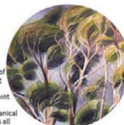
Nor'wester by Kris Waldrin, Acrylic on Canvas, 2015.

OPEN 10AM - 4PM TUES - SUN WWW.ARTSINOXFORD.COM